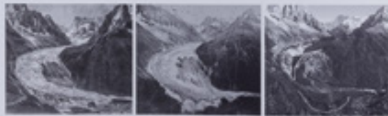
Two views of the study of a retreating and advancing glacier tongue. The left photograph shows the glacier tongue in a wide, flat expanse, while the right photograph shows the glacier tongue in a narrow, jagged expanse.